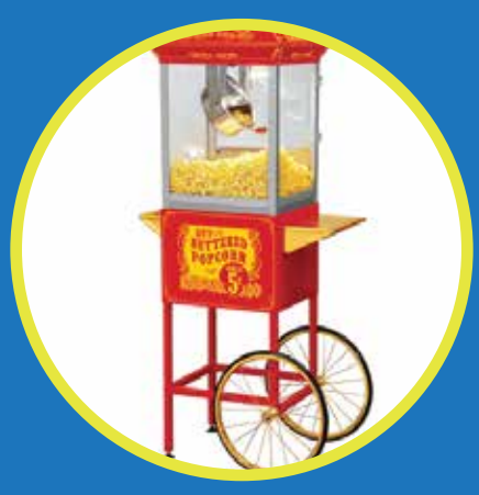
MISC EQUIP. RENTAL