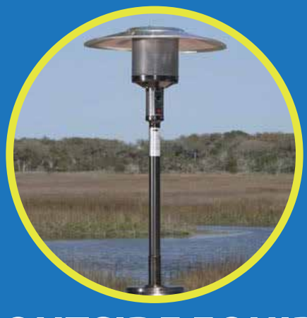
OUTSIDE EQUIP. RENTAL